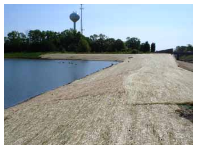
Erosion control blanket stabilizes pond slopes.

to promote vegetation establishment. A wide variety of blankets and mats exist for use under varying circumstances. In addition, compost can be used for erosion control and site stabilization. For more information, see the Minnesota Stormwater Manual at <u>http://www.pca.state.mn.us/publications/wq-</u> <u>strm9-01.pdf</u>.