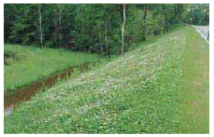
Final stabilization is achieved when all soil disturbing activity is completed and the exposed soils have been stabilized with a vegetative cover with a density of 70% over the entire site.

The permanent stormwater treatment system must be in place and functioning. Drainage ditches and other conveyance systems must have all collected sediment cleaned out and be stabilized with permanent cover. Temporary erosion and sediment control BMPs must be removed.