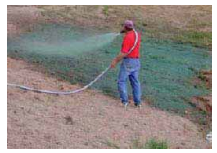
Hydroseeding promotes the rapid growth of vegetation and prevents erosion.