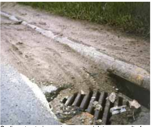
Sediment entering a storm sewer inlet as a result of construction related erosion.

Erosion is the natural process in which soil and rock material is weathered and carried away by wind, water or ice. On a construction site there are factors such as rainfall, climate, location, and soil type that influence erosion and may not be controllable.