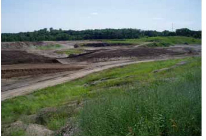
Leave as much vegetation on a site as possible to reduce the overall disturbed area.

Any and all tools that you plan to implement on the site should be included in the site's SWPPP. When writing the SWPPP, include a description of the practices and integrate them into the time line of all construction activities. In addition, label the locations of the practices on site plans and include detailed specifications for each practice. Including these elements into the SWPPP before construction activity begins will aid in proper planning for the site and ensure that the sediment and erosion control techniques are implemented effectively and efficiently.